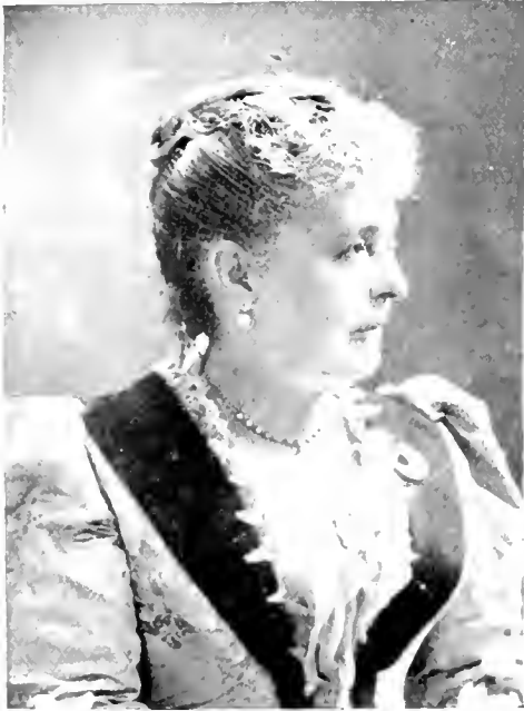
CAROLINE LAVINIA SCOTT HARRISON.